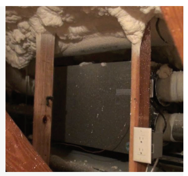
Energy Recovery Ventilator installed in the home.

A home recently dealt with excessive humidity levels in several of its rooms. The house was designed and built using energy efficiency best practices which included spray foam insulation. Cooking, showering, breathing, and other day-to-day activities generate a moisture load that needs to be removed. If the house is sealed tight with spray foam, it is much harder for this moisture to leave naturally. It builds up inside the home and can raise relative humidity to uncomfortable and even dangerous levels. To make matters worse, the air conditioner's run time is reduced due to the spray foam's effective thermal insulation, meaning less ability to remove moisture.